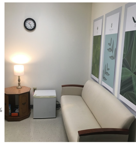
This dedicated lactation room is the newest of six lactation rooms available to nursing mothers who work for the Department of Health.

The American Academy of Pediatrics recommends that infants be exclusively breastfed for about the first 6 months with continued breastfeeding alongside introduction of complementary foods for at least 1 year.